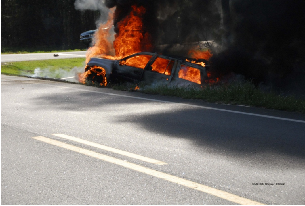
Figure 2- 1999 Grand Cherokee (WJ) Fatal Fire.

The photograph provided below shows a Grand Cherokee in flames after being struck in the rear by a Dodge Dakota pickup truck. A child seated in a rear seat died in this crash.