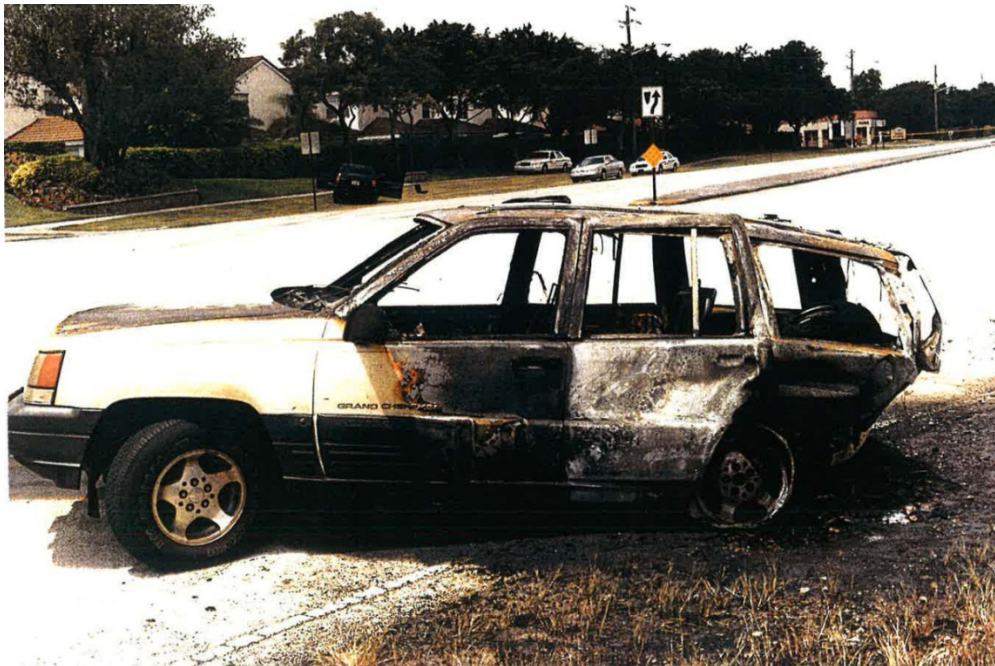
Figure 1 Post-Crash photograph of Grand Cherokee (ZJ) fatal rear impact vehicle.

An example of a Grand Cherokee involved in a rear impact fatal fire crash is pictured below.