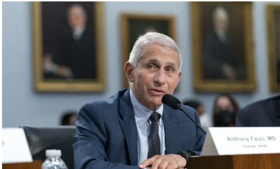
📷 Dr Anthony Fauci testifies on Capitol Hill on 11 May.

Fauci said ‘no’ when asked if he would stay on as National Institute of Allergies and Infectious Diseases director under Trump again