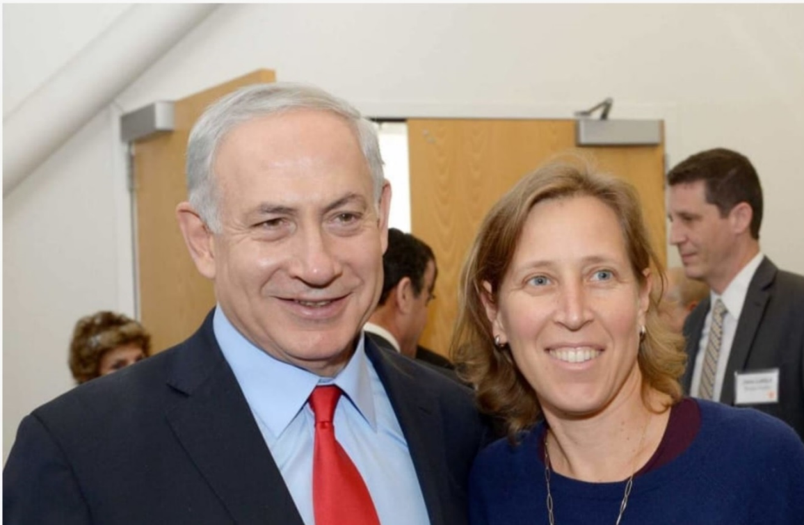
Photo of Netanyahu and Wojcicki in 2014, at a joint meeting at Silicon Valley